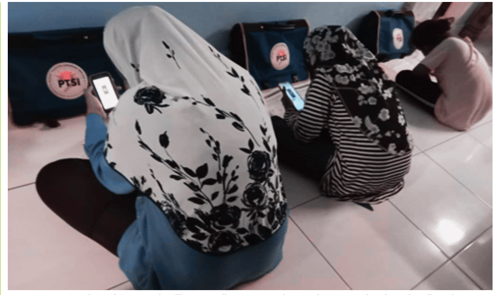
Students from B40 families attending Pusat Tuisyen Sinaran Impian (PTSI) online classes